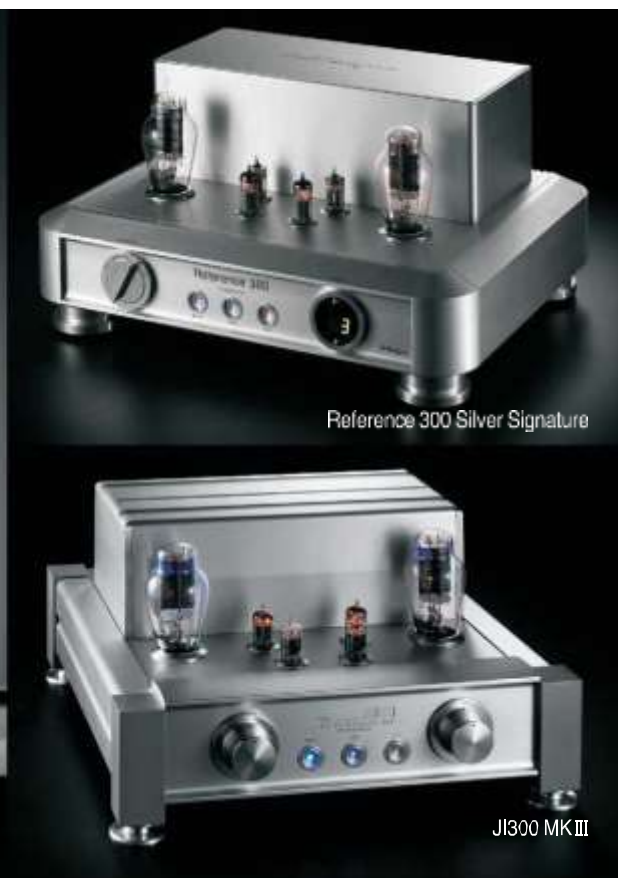
Reference 300 Silver Signature