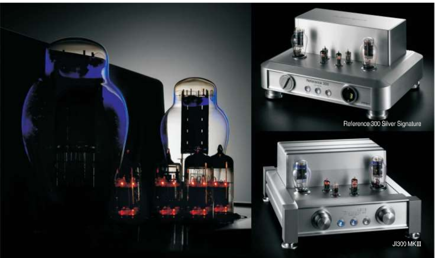
Reference 300 Silver Signature

The Ji-300 and Reference 300 series are easily the ultimate integrated amplifiers in existence today and we are quite confident that they are among the very finest music amplifiers on the market, even when compared to our own more expensive products. We achieve the highest musical potential of the classic WE300B triode with innovative designs engineered for today's world-class systems.